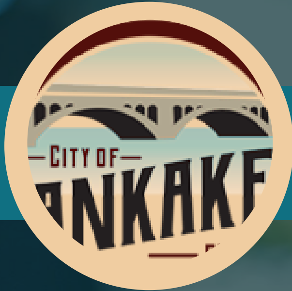
City of Kankakee